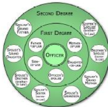
AFFINITY KINSHIP Relationship by Marriage