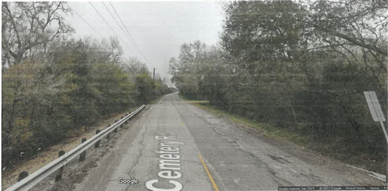
Cemetery Rd - North of Dickinson Bayou Bridge