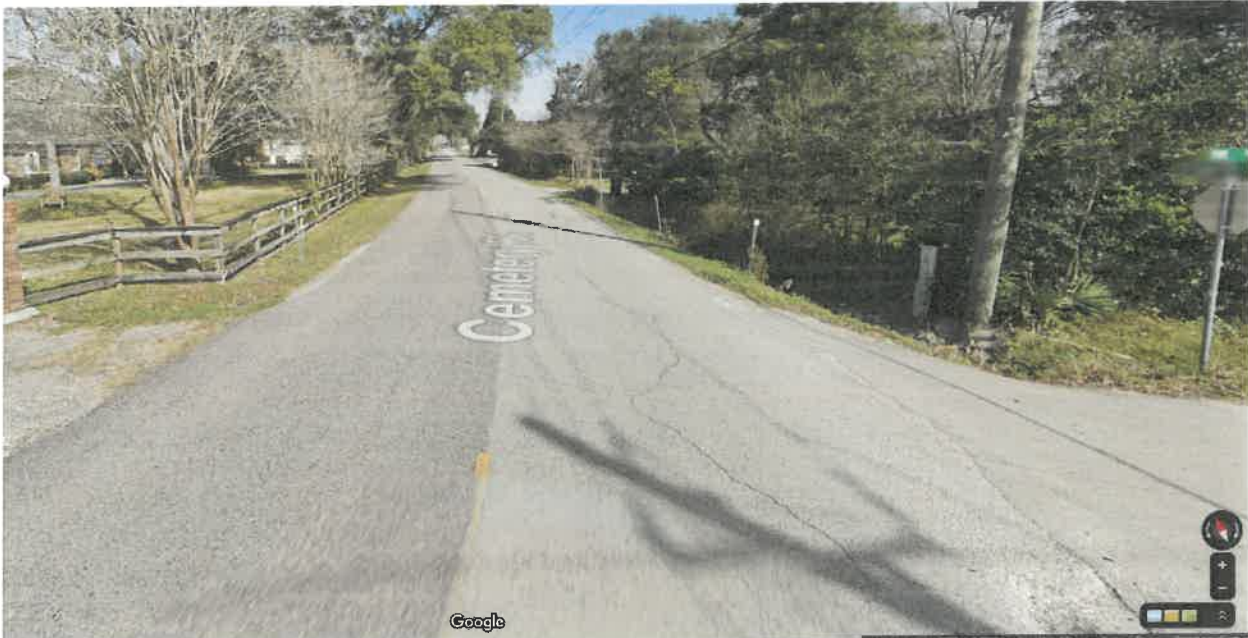
Cemetery Rd – at Pine.