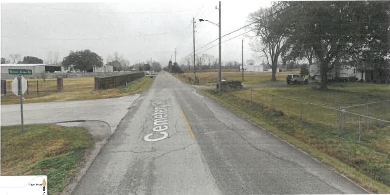
Cemetery Rd - at Broken Arrow